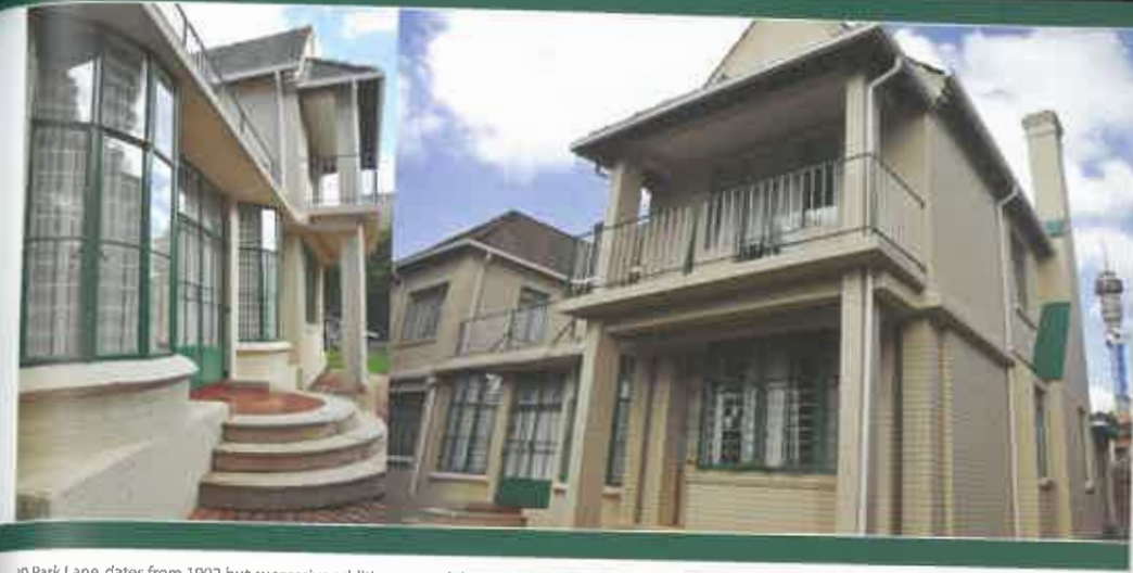
30 Park Lane, dates from 1902 but successive additions record the architectural styles over its lifetime.

1895 Victorian Colonial Home, Muzi Yami, later named Eridge House Vacant land in front of Eridge House being cleared for the new student residence Parktown Village II student residence with a glimpse of World Cup dresse: Hillbrow towe